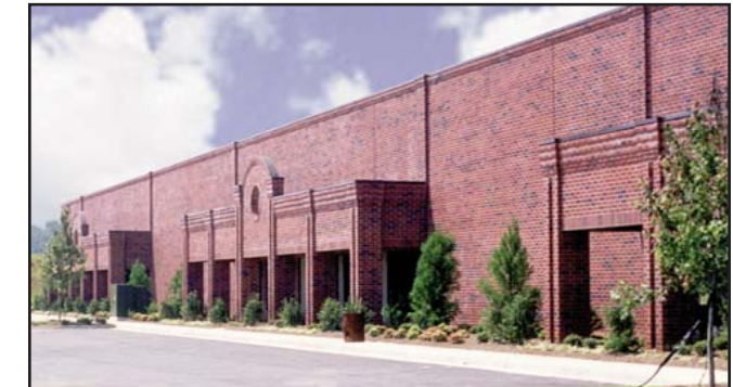
Multi-Unit Building, Site #9 9,914 - 81,040 SF 5405 Rafe Banks Drive