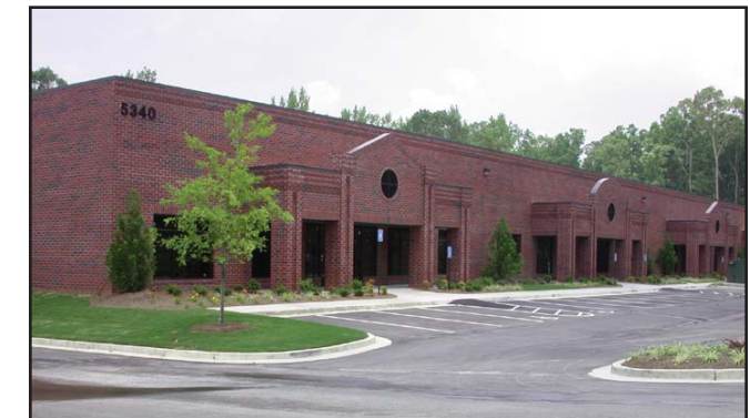
Multi-Unit Building, Site #14 6,400 - 64,000 SF 5340 McEver Road